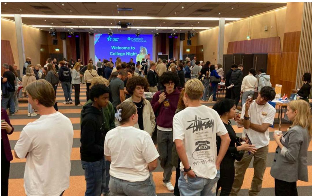
College Night 2024, in Utrecht