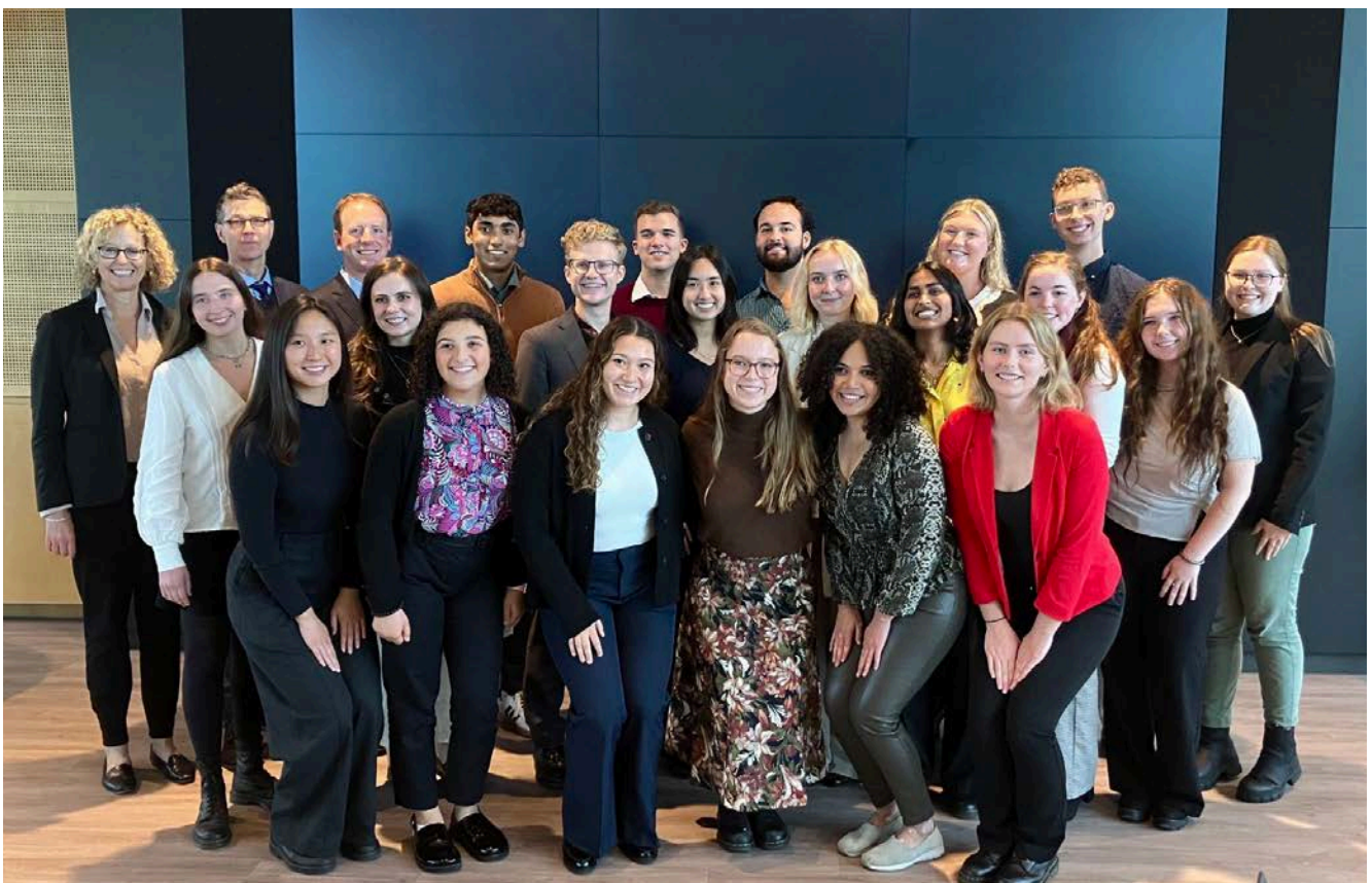
US Fulbright grantees orientation at the Ministry of Education, Culture and Science, September 2024

such, they are given a great deal of support to facilitate this role. Dutch students receive support in the form of orientations and preparatory courses in the United States. During their stay they are invited to regional conferences and events and can participate in seminars, conferences, and special social and cultural events organized by their host institutions. American students and scholars receive assistance in the form of orientations, mid- and end- of-year evaluation sessions, and other events. They participate in social activities offered by the Fulbright Commission and the Netherlands Fulbright Alumni Association (NFAA). Both in the United States and in Europe, grantees can take part in enrichment activities. In the Netherlands, Fulbright students may take part in a speakers program and are invited to high schools to speak about topics such as American politics, immigration, or diversity issues.