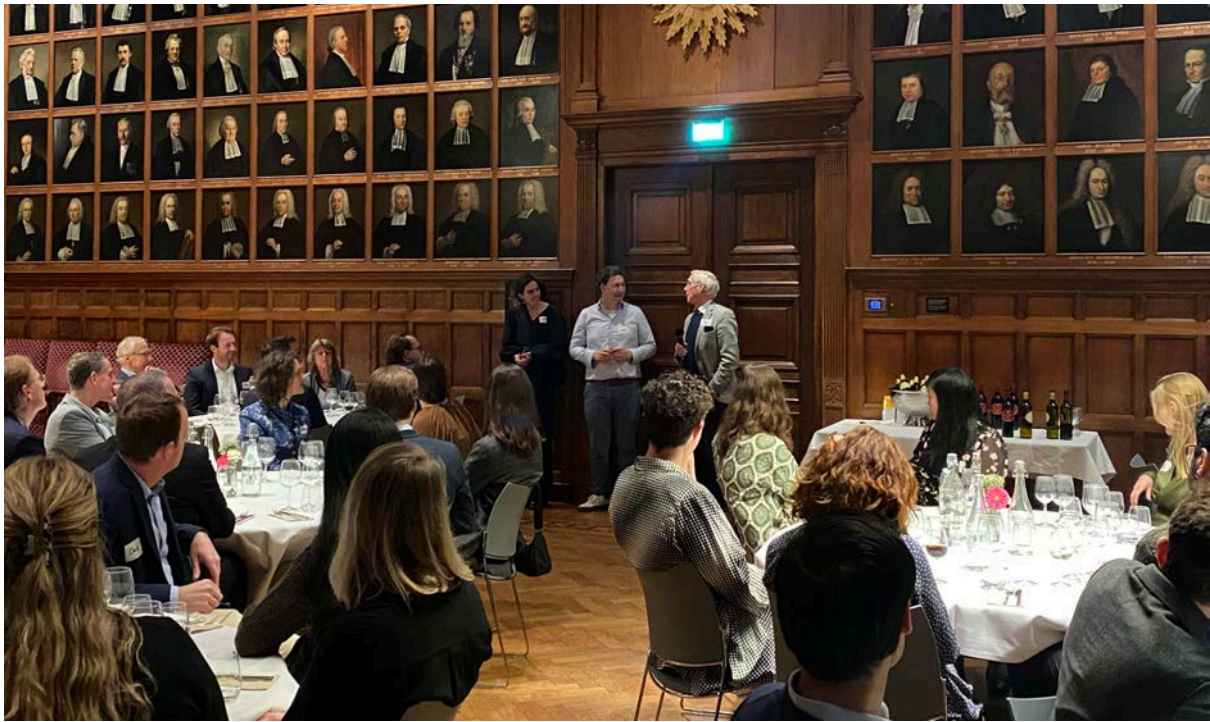
NFAA Thanksgiving Dinner at Utrecht University's historic Academy Building