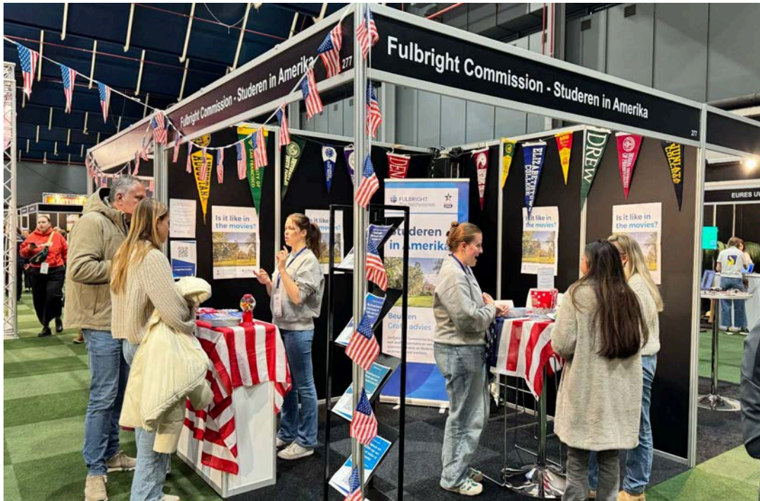
Fulbright Commission/EducationUSA booth at the Buitenlandbeurs, November 2024

In late September 2024, we organized our annual College Night, which is part of the EducationUSA Western & Central Europe Fairs. More than 200 secondary students, their parents and school counselors signed up to meet with representatives from 19 American universities and testing organizations to learn about study opportunities in the United States. In November 2024 we organized the EducationUSA LLM Fair, which is hosted by a local law firm each year and allows law graduates to meet with representatives of American law schools for more information on LLM degrees.